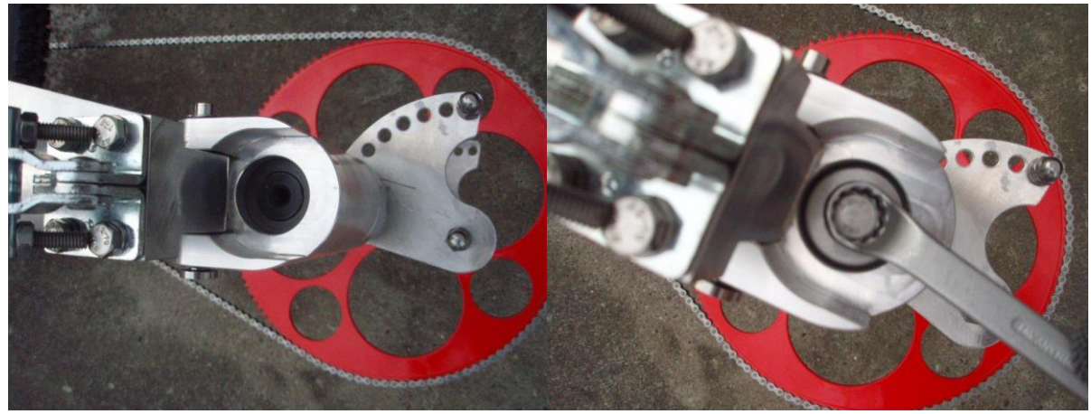
Mount the drums on the axis and fasten the clip with the screwdriver.

Connect the axis with the drive unit and fasten the bolts.