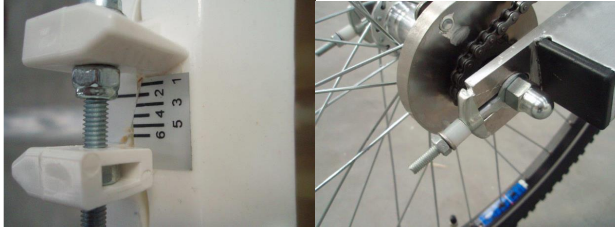
Adjustment of the chain gear

Adjustment of the amount of material coming out of the drum